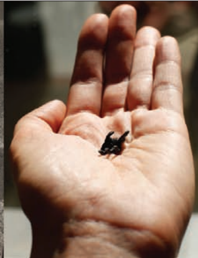
Serbian fascists killed humans.