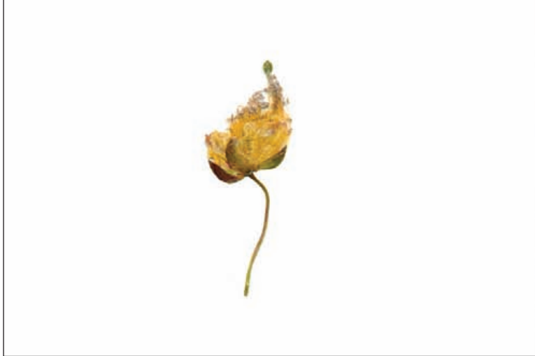
[object] 6.6.11. Dubrovnik, Croatia. Walk from University to Hotel.