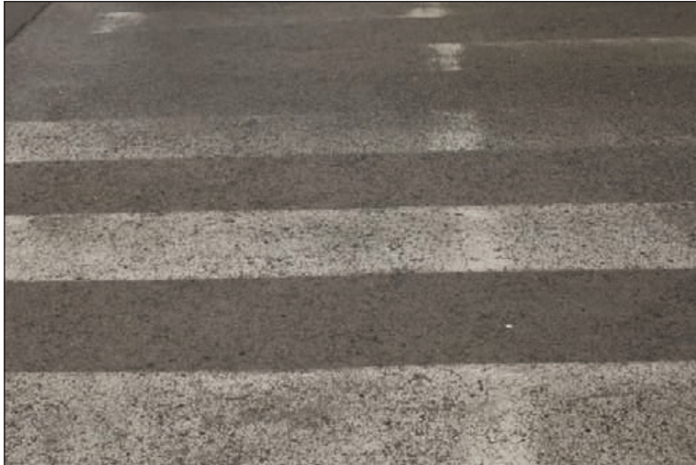
[photograph] 6.11.11. 9:37 a.m. (9:39 a.m.) Sarajevo, Bosnia and Herzegovina. Where WWI began.