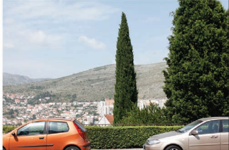
[photograph] 6.8.11. Dubrovnik, Croatia. Walk from University to Hotel